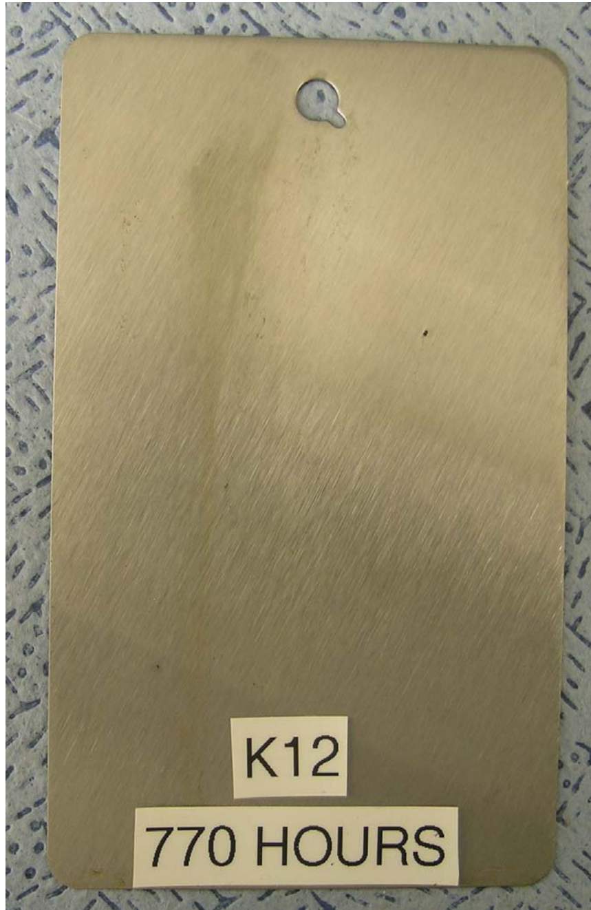
Panel K12, after 770 hours in ASTM D 1748 humidity cabinet.