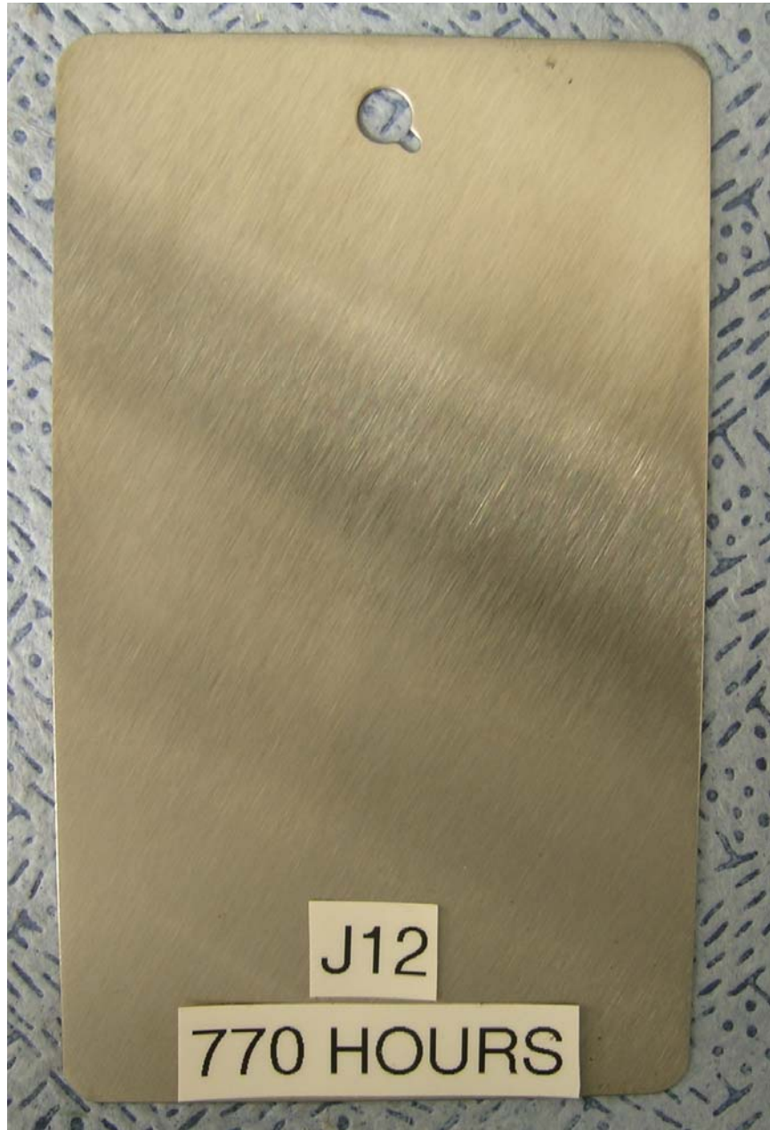
Panel J12, after 770 hours in ASTM D 1748 humidity cabinet.