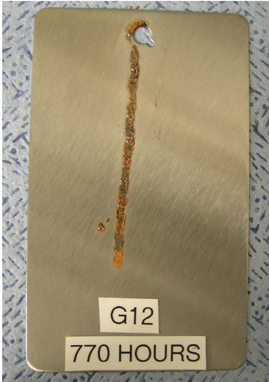
Panel G12, after 770 hours in ASTM D 1748 humidity cabinet.