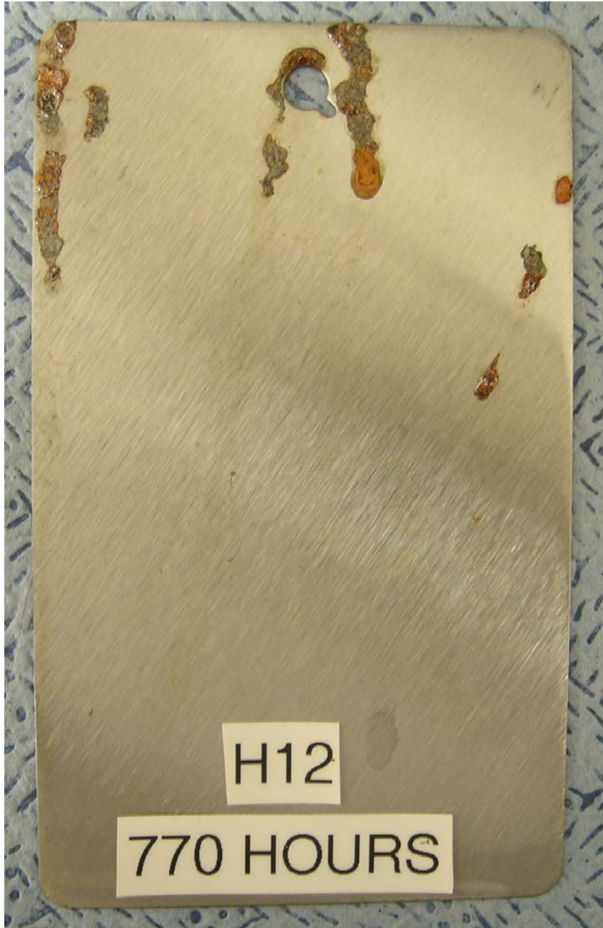
Panel H12, after 770 hours in ASTM D 1748 humidity.