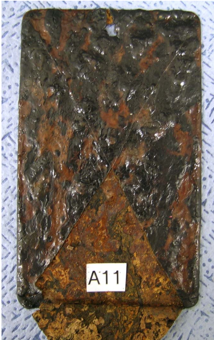
Corroded panel, after conversion with Rust-Oleum Rust Reformer (bulk version).