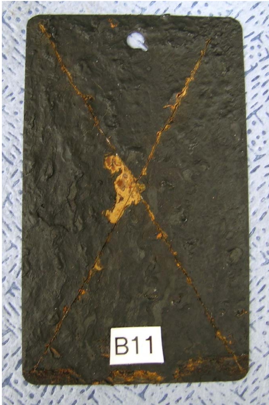
Corroded panel, after conversion with Rust-Oleum Rust Reformer Spray.