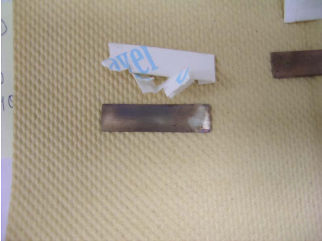
Silver Saver Paper