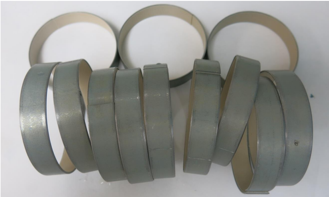
Picture 4: Parts labeled as “Saint Gobain, 3%”, packaged in a VpCI-126 bag.