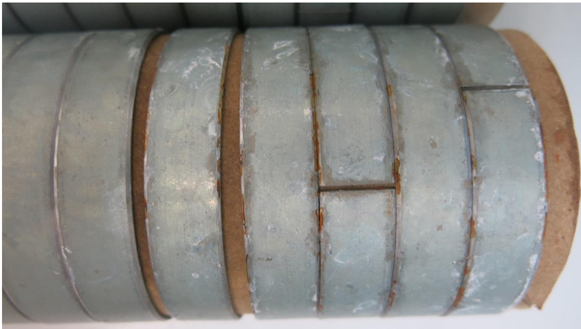
Picture 2: Close-up of the rust and oxidation on parts in the bag labeled “3%, U-Line Bag”.