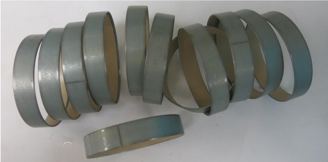
Picture 5: Parts labeled as “Saint Gobain, ~5%”, packaged in a VpCI-126 Bag.