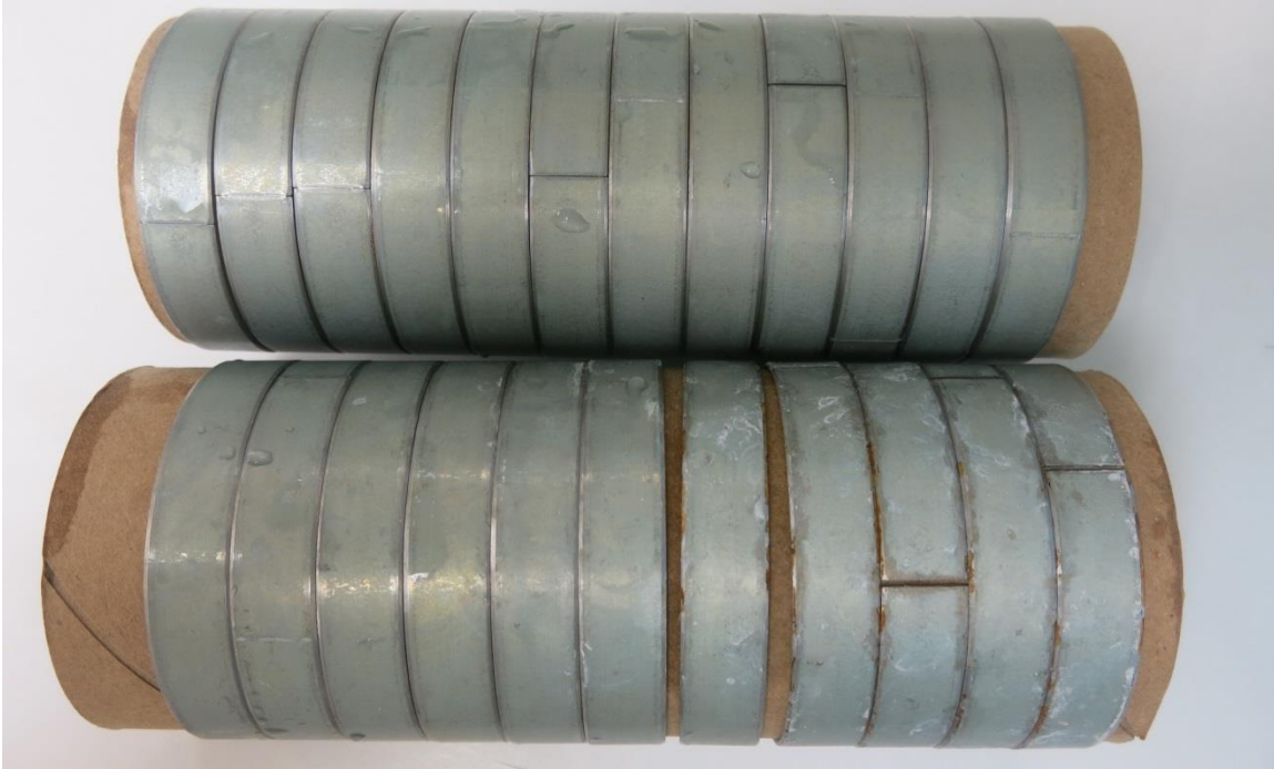
Picture 1: Parts packaged in “3%, U-Line Bag” labeled bag. Light corrosion and oxidation can be seen on the pieces.