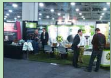
Cortec's trade show booth at NACE 2012.