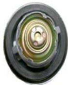
Protected with VpCI-705 Bio

VpCI-705 Bio offers multi-metal protection for all common engineering metals used in fuel systems including aluminum, aluminum