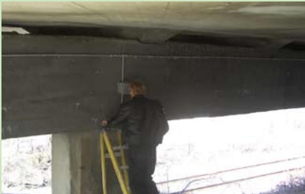
Bridge in 2006