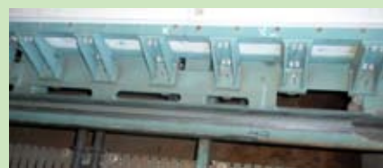
Roller Coaster rail before any coatings were applied

The amusement park engineers were very happy with this application and have since approved the use of VpCI®-Corrverter® and VpCI®-395 on other rides in the park.