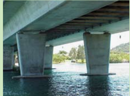
Site of new Australian GalvaCorr® trial

After four years, the numbers show greatly reduced corrosion from the control side and the photos below show the visual difference of the concrete.