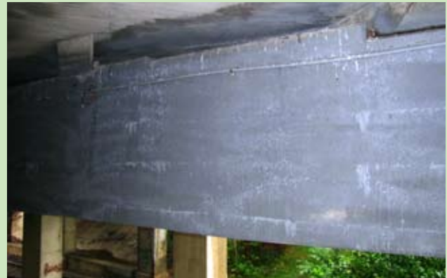
Bridge in 2009