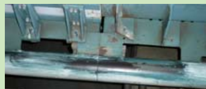
VpCI®-Corrverter® being applied at 3-5 wet mils (75-125 microns)