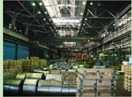
Severstal Metallurgical Factory located in Cherepovets, Russia.