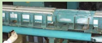
VpCI®-395 Teal being applied at 3-5 wet mils (75-125 microns)