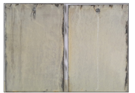
Oxidized panels after being cleaned, coated with VpCI®-373/VpCI®-395/ EcoShield® VpCI®-386 Clear, and subjected to 1,000 hours in salt fog.