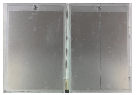
Oxidized panels after being cleaned, coated with VpCI®-373/VpCI®-395/VpCI®-384 Aluminum, and subjected to 1,000 hours in salt fog chamber.