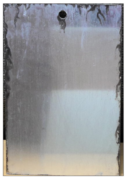
Oxidized aluminum panel after oxide removal with VpCI®-426 and cleaning with VpCI®-415.