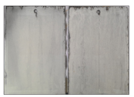
Oxidized panels after being cleaned, coated with VpCI®-373/VpCI®-395/VpCI®-384 Clear, and subjected to 1,000 hours in salt fog chamber.

with Vapor phase Corrosion Inhibitors can play an important role in mitigating existing corrosion and minimizing future corrosion.