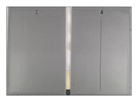
Oxidized panels after being cleaned, coated with VpCI®-373/VpCI®-395/ EcoShield® VpCI®-386 Aluminum, and subjected to 1,000 hours in salt fog.