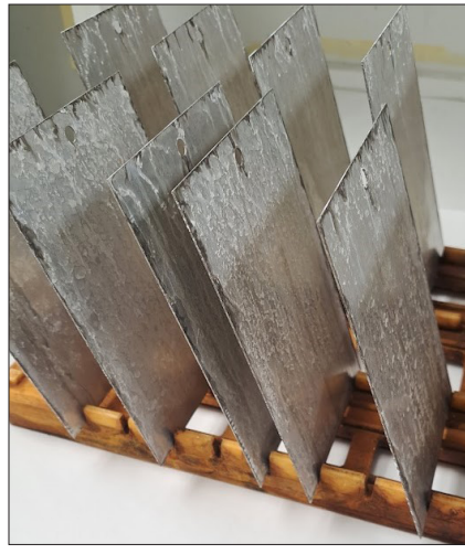
Oxidized aluminum panels after 500 hours in salt fog chamber.